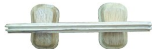
Set of Three Oak Bar Handles, and T-ends