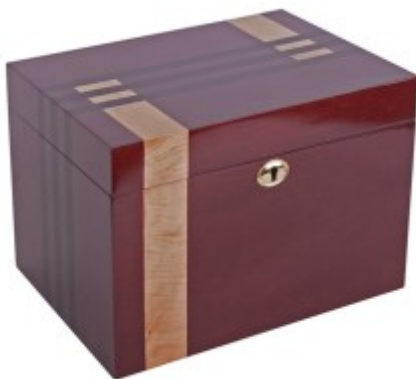
with Inlaid Wooden "Azure" Casket £295