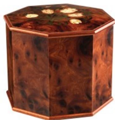
with Florence Urn £685