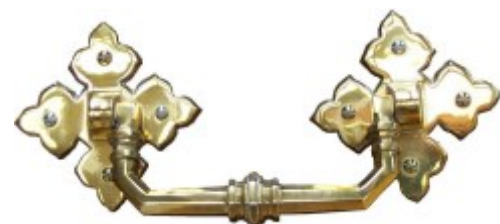
Set of Antique, Solid Brass Gothic Handles