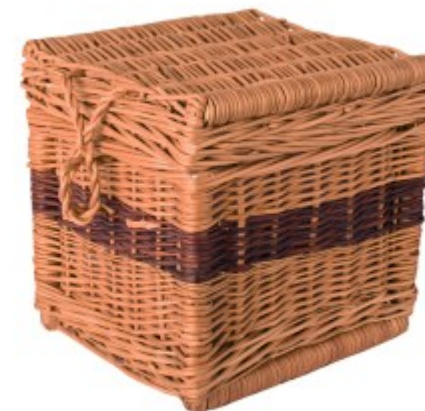
with Oasis Willow Casket £195