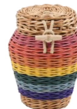
with Round Rainbow Willow Urn Handmade In Somerset £245

Our Prices Include for the Collection/Receiving of the Ashes, for taking responsibility for them and for storage on our premises for up to thirty days Subject to availability