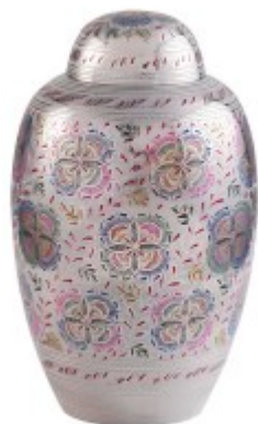
with "Grace" Urn £310