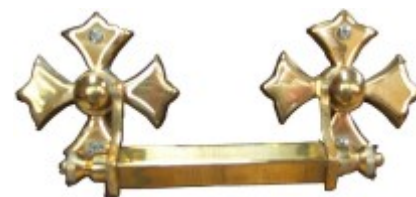
Set of Solid Brass Handles