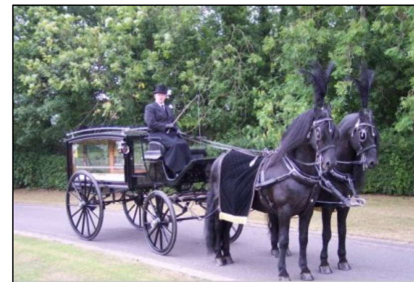
Horse-Drawn Hearse with a pair of Black Horses and black Hearse. Additional charge from: £1495