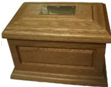
with Solid Oak Casket £225