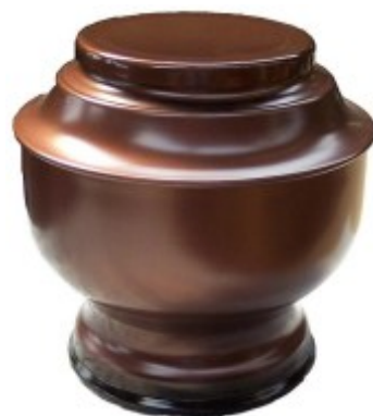
with Metal Spun Urn £195