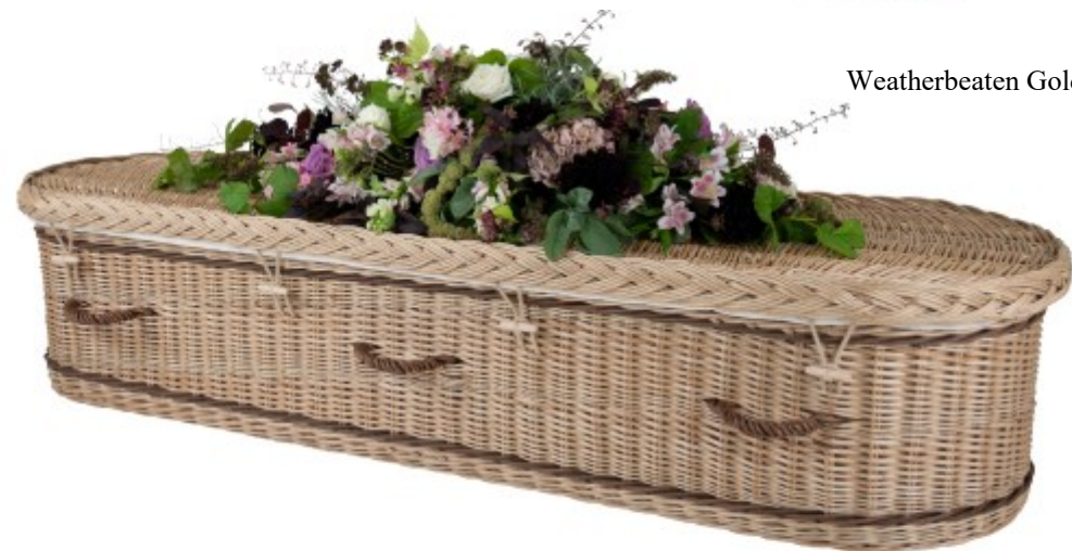
Weatherbeaten Gold with Brown