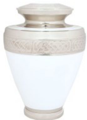
with Brass "Marble White" Urn £310