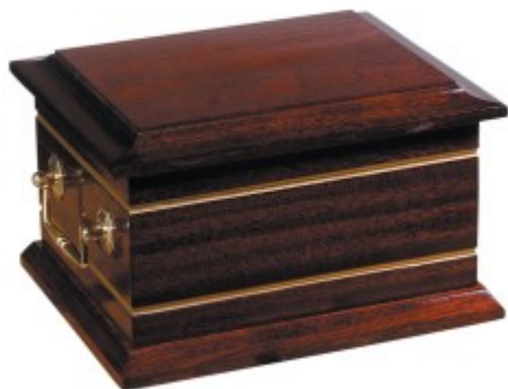
with Solid Wood "Lesbury" Urn £310

Our Prices Include for the Collection/Receiving of the Ashes, for taking responsibility for them and for storage on our premises for up to thirty days Subject to availability