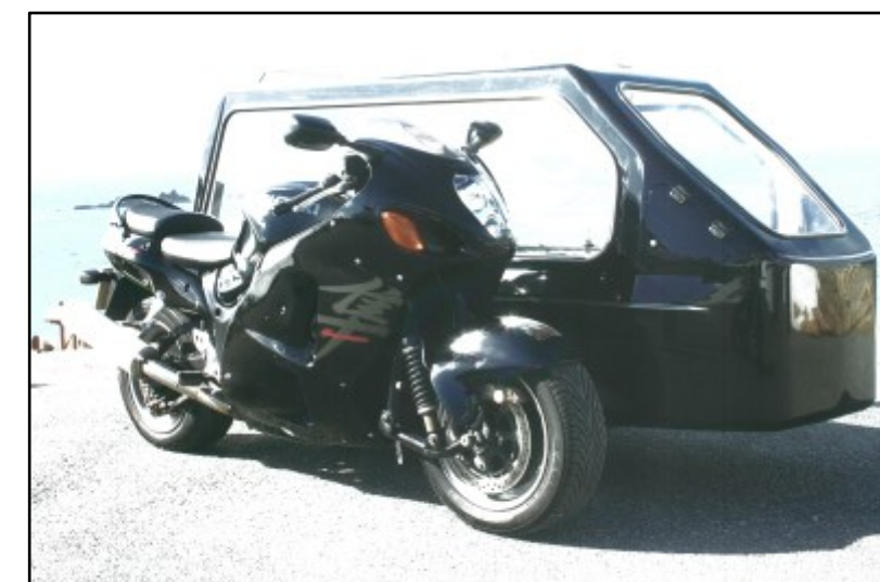
Motorcycle Hearse Additional charge from: £1355