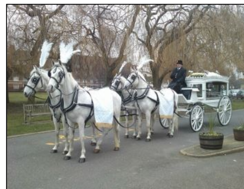
Horse-Drawn Hearse with 2 pairs of White Horses and a white Hearse. Additional charge from: £2155