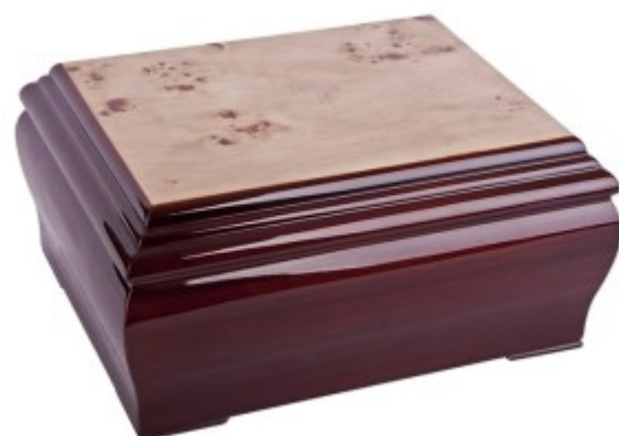
with Continental Casket £265