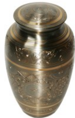
with "Sovereign" urn £305