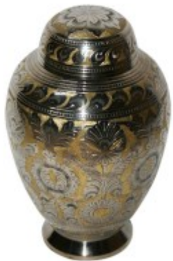
with Ambassador Urn £320