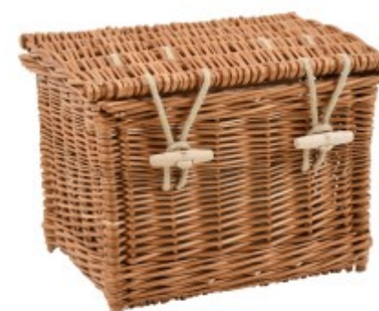
with Buff Willow Casket Handmade In Somerset £245