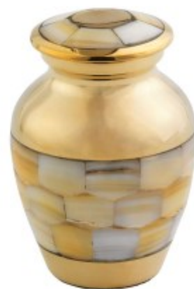
with Mosaic Urn £310