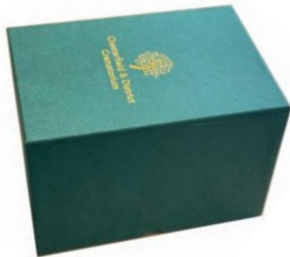
with Crematorium Box £65