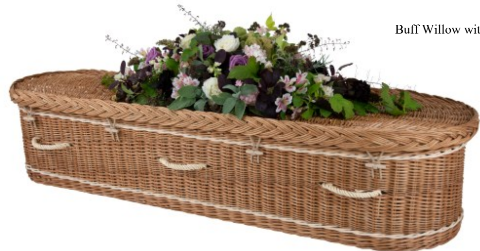
Buff Willow with Cream