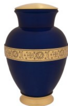
with Blue Harvest, Metal Urn £375