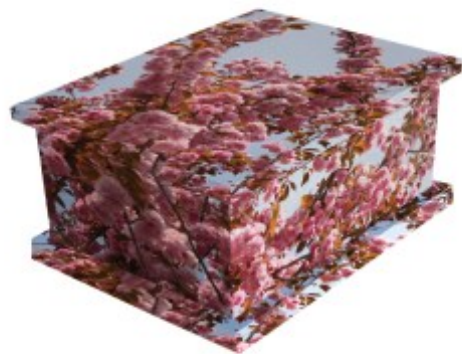
with Spring Blossom Casket £310