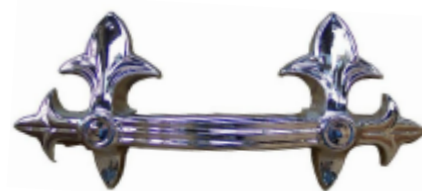
Set of Three Nickel Finished Fleur Handles