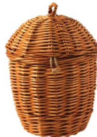
with Round Oasis Willow Urn £195