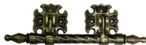
Set of Three Antique Brass Bar Handles, and T-ends