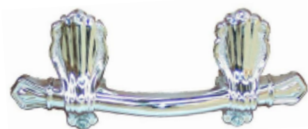
Set of Three Cast Metal Nickel Finished Doric Handles