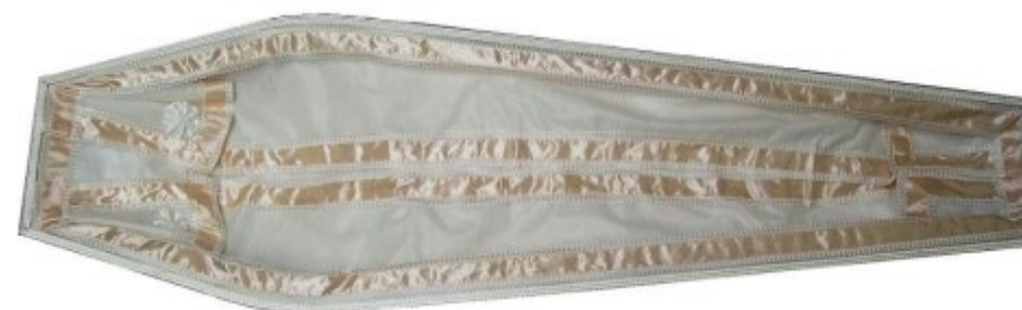
A Coffin Interior