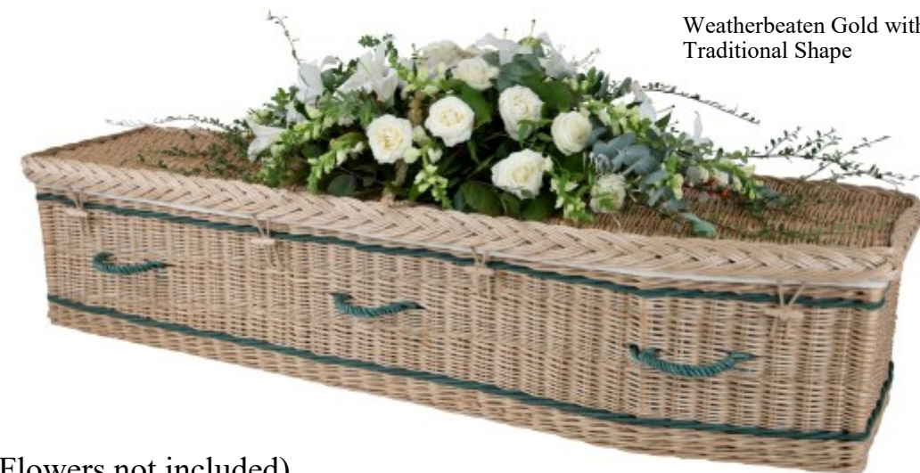
Weatherbeaten Gold with Green Traditional Shape