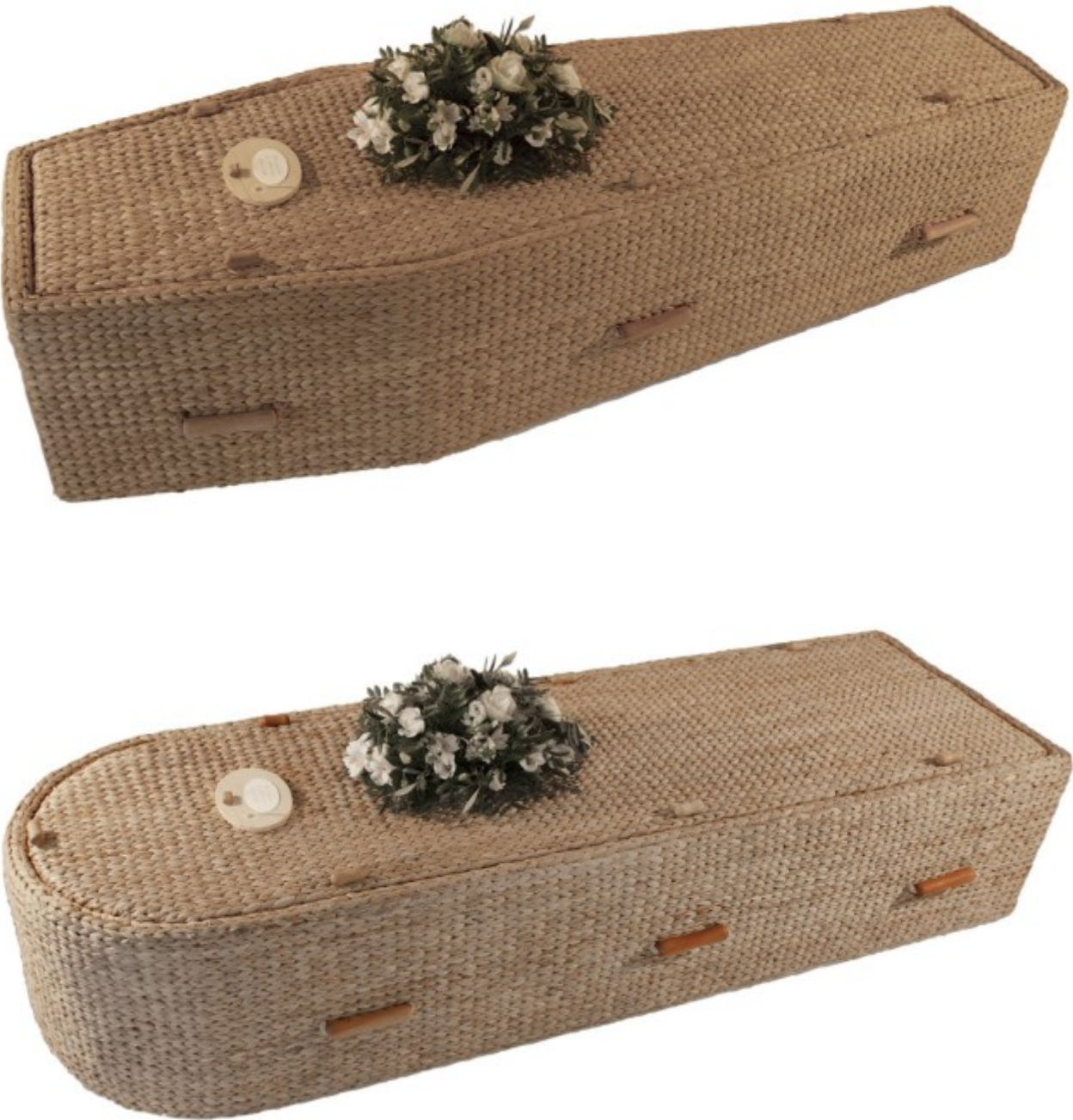
(Flowers not included)