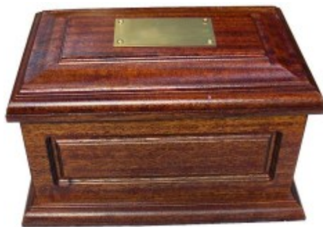
with Solid Mahogany Casket £225