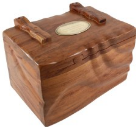
with Solid Wood "Trent" Urn £305