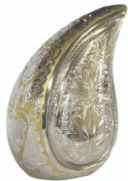
with Teardrop Patterned Urn £405 Inc. Keepsake - £495