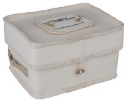
with White Woollen Urn £255