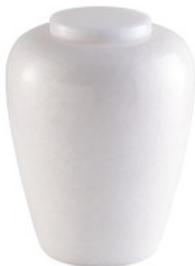
with "Simply Marble" Urn £310