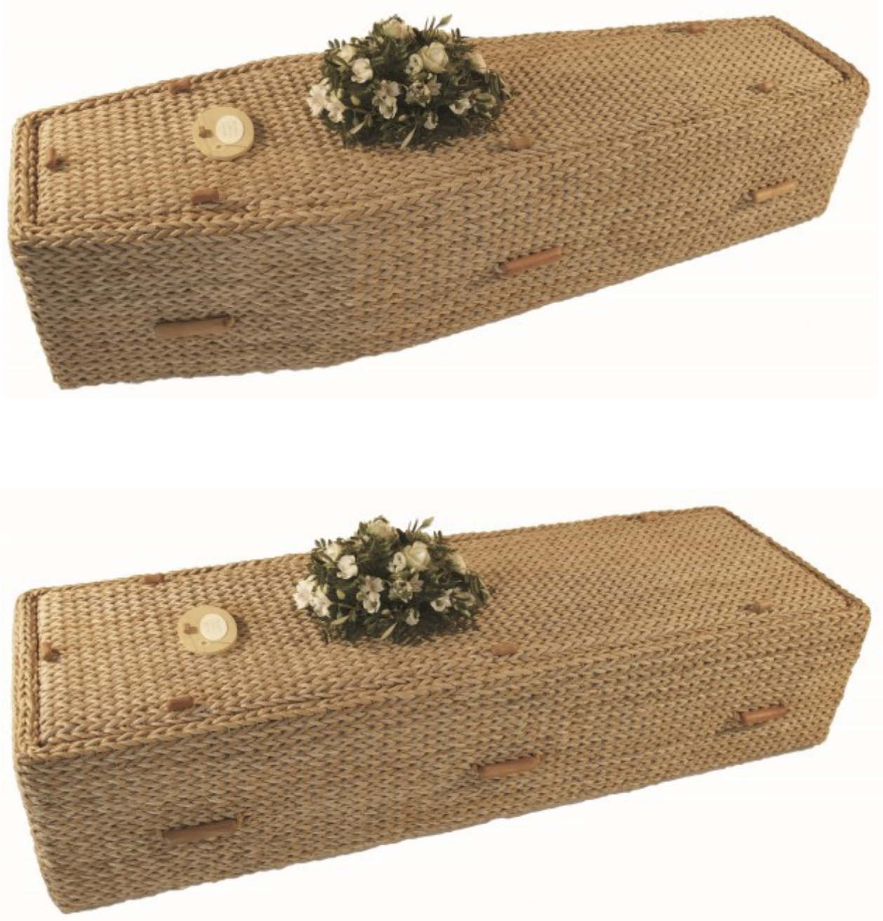
(Flowers not included)